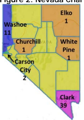
Figure 2: Nevada Charter School Campuses FY 2016

Nevada currently has 39 charter schools operating at 55 campuses. Figure 2 illustrates the geographic distribution of these campuses across the State. Charter campuses are concentrated in the urban counties of Clark and Washoe. There are also charter campuses in four rural counties. Eleven counties lack a charter school campus, but there are six online schools based in Clark County (five) and Washoe County (one) that serve the entire State.